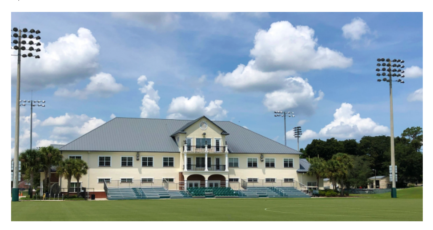
Athletic Training Center Weight Room